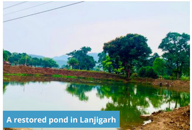
A restored pond in Lanjigarh

In FY24, we recycled over 15 billion litres of water across our operations, roughly equivalent to 6,000 Olympic-size swimming pools. Further, we helped restore over 60 water bodies in the communities across our operational areas in rural India during the same period: 47 in Korba, Chhattisgarh, 10 in Jharsuguda, Odisha, and 3 in Lanjigarh, Odisha. In our journey towards becoming Net Water Positive by 2030, we have also achieved a significant 11% reduction in withdrawal from freshwater sources.