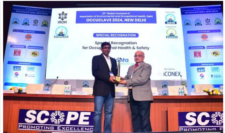
Vedanta Jharsuguda bags recognitions at OSP Security Awards 2024