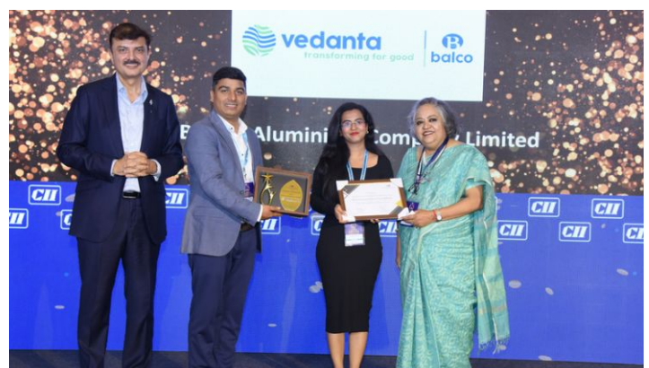
Vedanta Jharsuguda and BALCO win accolades at the 14th CII National HR Excellence Award