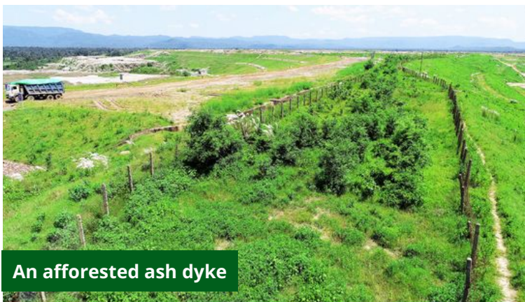
An afforested ash dyke