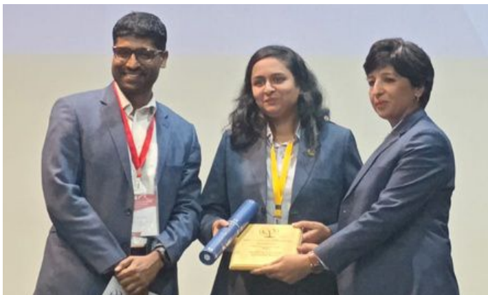
Vedanta Jharsuguda bags National Awards for excellence in Water and Ash Management