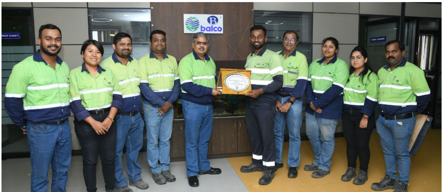
BALCO clinches prestigious 'Platinum Award' for Occupational Health & Safety Excellence