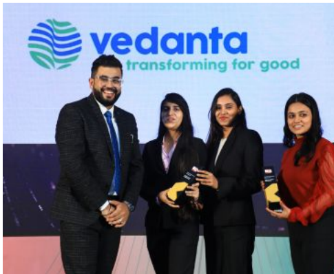
Vedanta Lanjigarh wins ET HRWorld's Exceptional Employee Experience award