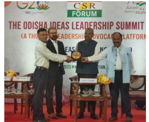
Vedanta Lanjigarh wins Ideas Excellence Award 2023 from Odisha CSR Forum