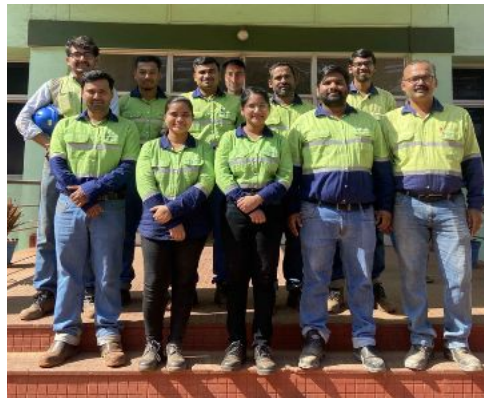
Vedanta Lanjigarh's team bags five Gold Awards at ICQCC '23 in China