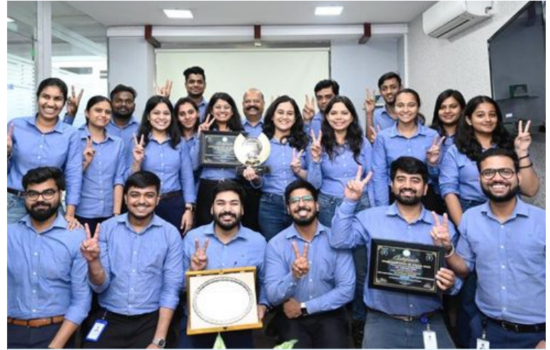
Vedanta Jharsuguda receives the prestigious Grow Care Awards 2023 for HR excellence