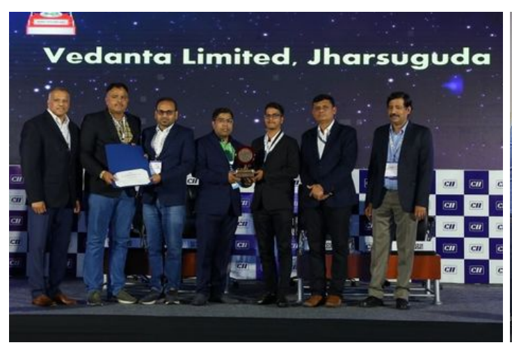
Vedanta Jharsuguda wins prestigious CII National Energy Award for Excellence in Energy Management