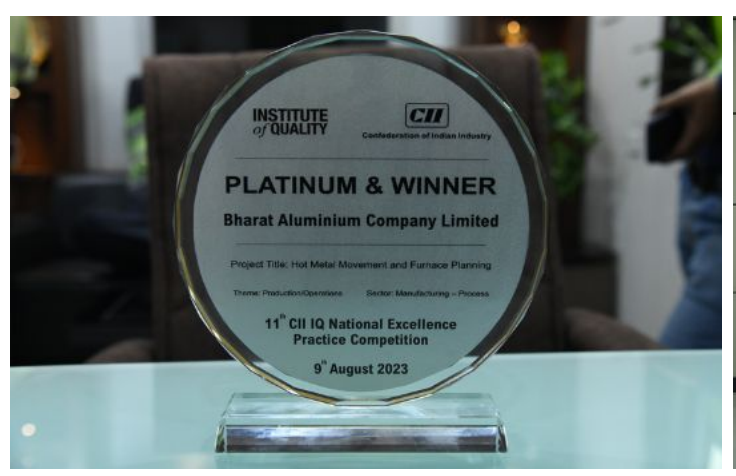
BALCO Earns CII Award for Excellence in Manufacturing Transformation