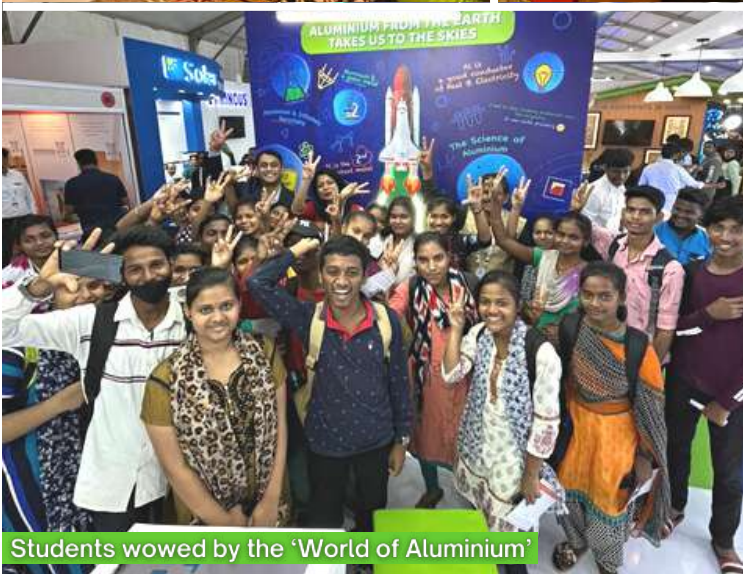
Students wowed by the 'World of Aluminium'