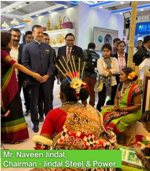
Mr. Naveen Jindal, Chairman - Jindal Steel & Power