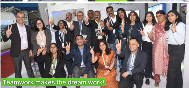
Teamwork makes the dream work!