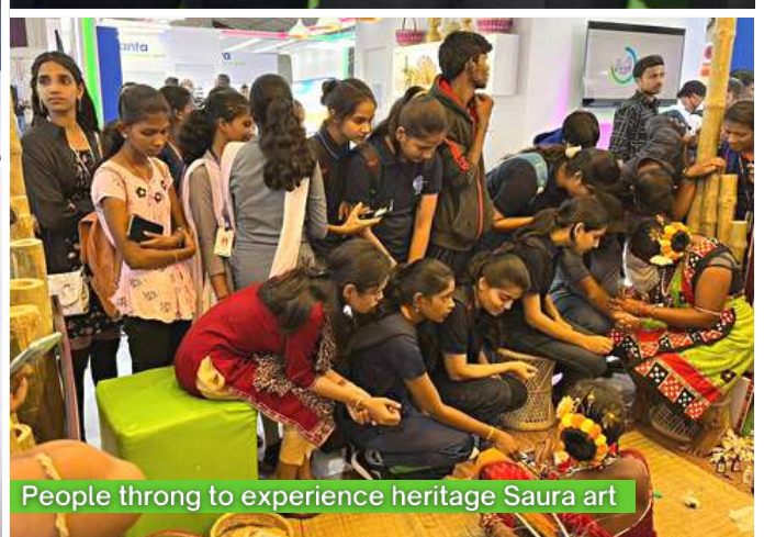
People throng to experience heritage Saura art